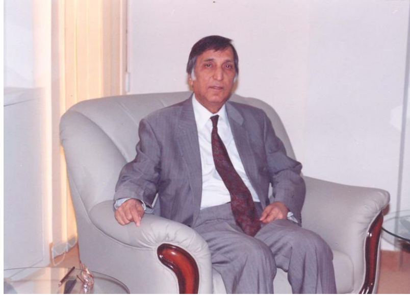
Late Dr. S. M. Qureshi

Pakistan like many other developing countries needs to develop its education system to achieve multiple goals of training people in emerging fields and at different levels, both quantitatively as well as qualitatively to run a contemporary modern society and meet the requirements of the new century concerning the economic development, national security as well as the value system.